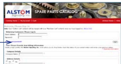
Log In Page