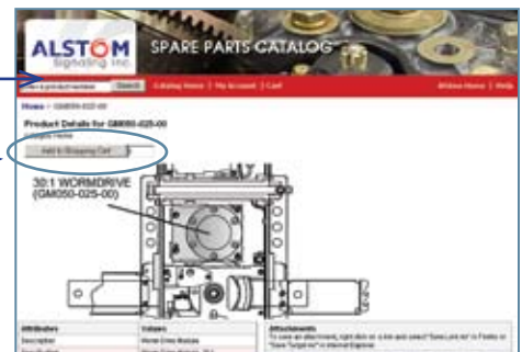
Product Detail Page