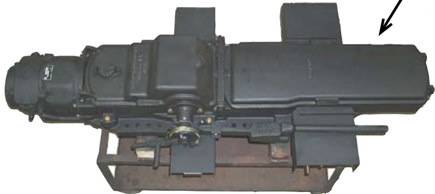
....and leaves completely remanufactured to OEM specifications and guaranteed as new.